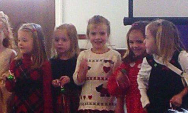
Four-year-old preschoolers sing joyfully during the Holiday Program

Registration for the 2010–2011 school year starts in January. Priority registration for current students, church members, and siblings will take place on January 18th through January 22nd during school hours (9:15 am to 12:45 pm). Open House for prospective parents will be held on January 20th.